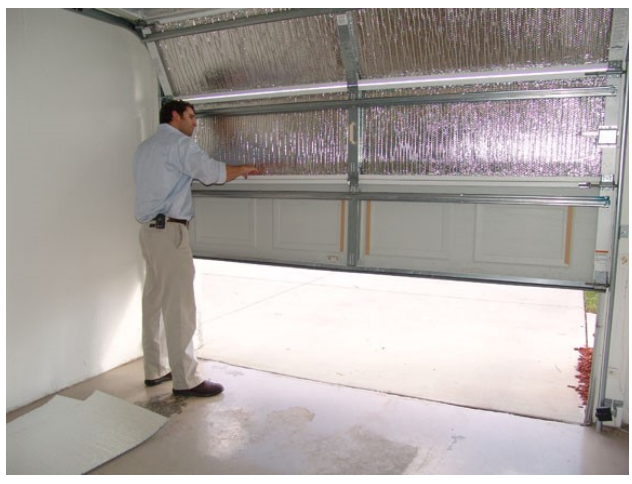
When safe to do so, it is helpful to partially open the door.