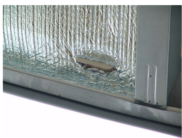
Some trimming and/or modification may be necessary.